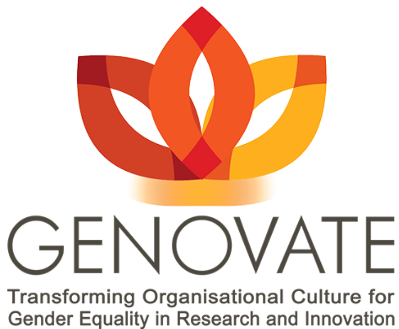
Figure 1 GENOVATE logos